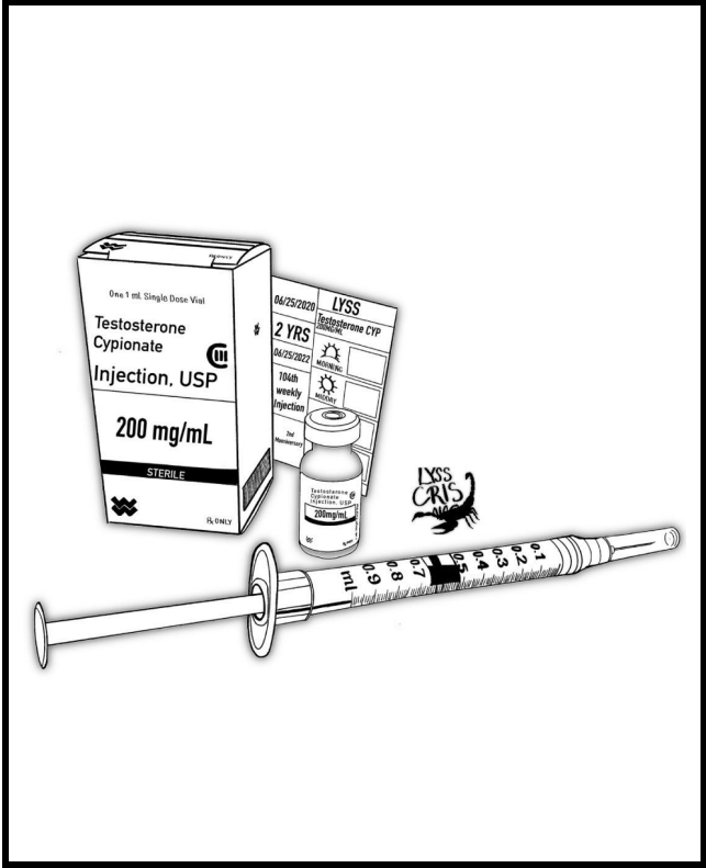
Lyss Cris 105th injection; two years of trans masc-hood