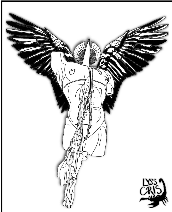
Lyss Cris Scars and Stripes: Spilling Our Guts